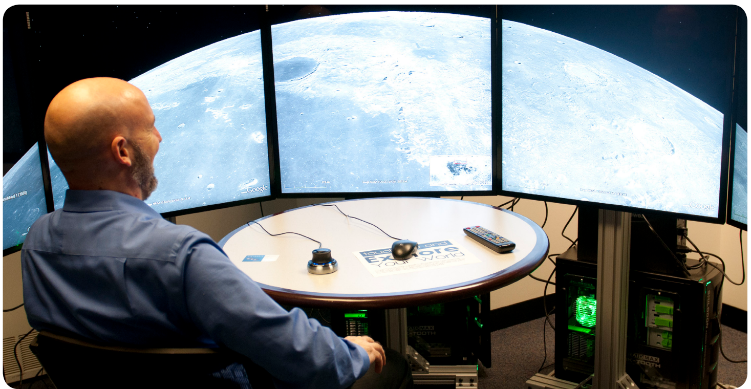
Brady Decker, CTO and Enterprise Architect for NASA HQ shows off the Moon.

without needing the application on their machine. This means that you can run one copy of a software program on one machine and set up the other machines to draw additional screens of data in order to make the field of view larger, essentially creating one giant computer. The OpenGov team has also configured both systems such that they can remotely monitor and control the system in order to make maintenance and repair easier.